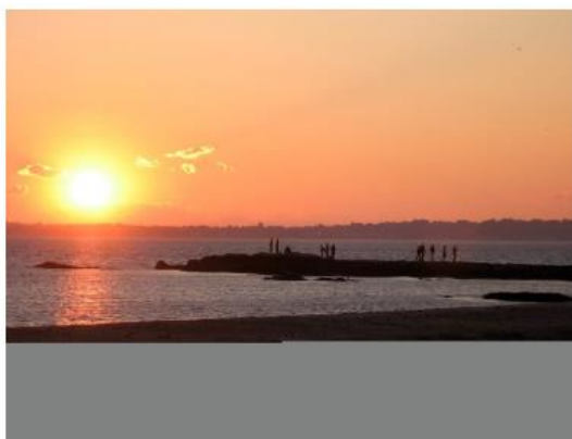
"Lighthouse Park on Long Island Sound, New Haven, Connecticut"

Travel to the area: West Haven and New Haven are located on the MetroNorth train line, with train access to New York's Grand Central Station within 90 minutes, and access to Boston via car or train in about 2.5 hours. Both cities are on the 95 corridor, providing easy highway access to other East Coast cities for bus or car trips. Fellows have taken weekend trips to Rhode Island, New York, New Jersey, Boston, Baltimore, and Maine.