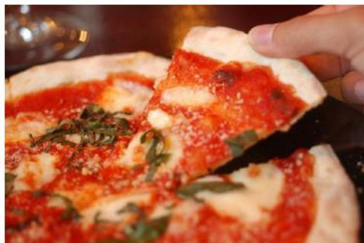
"Pizza in New Haven" available to Yale University affiliates