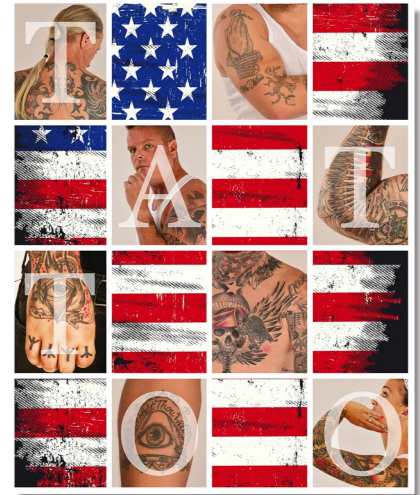
"Warriors, Tattoos, and the Stories They Tell"

Plans are in progress to exhibit the posters (and provide copies of the booklet) at the DC VAMC and Perry Point VAMC in coming months.